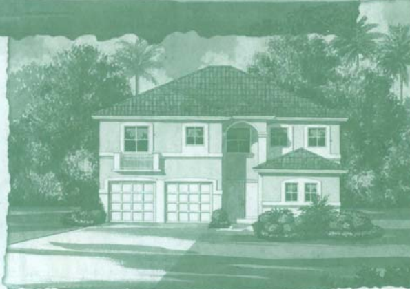
EMERALD MODEL - ELEVATION 2