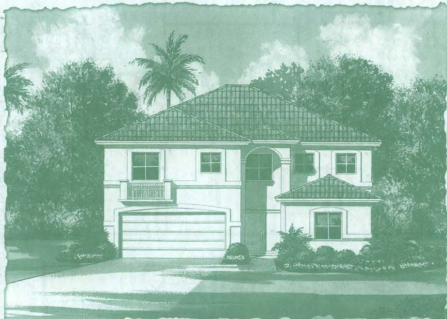
EMERALD MODEL - ELEVATION 1